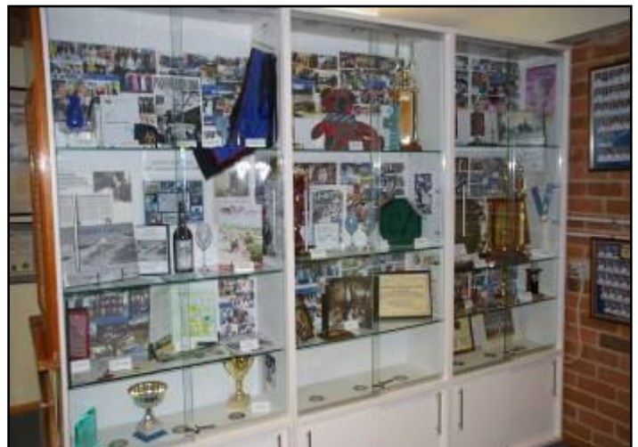
Jesmond High School archives in the CCJSC Library