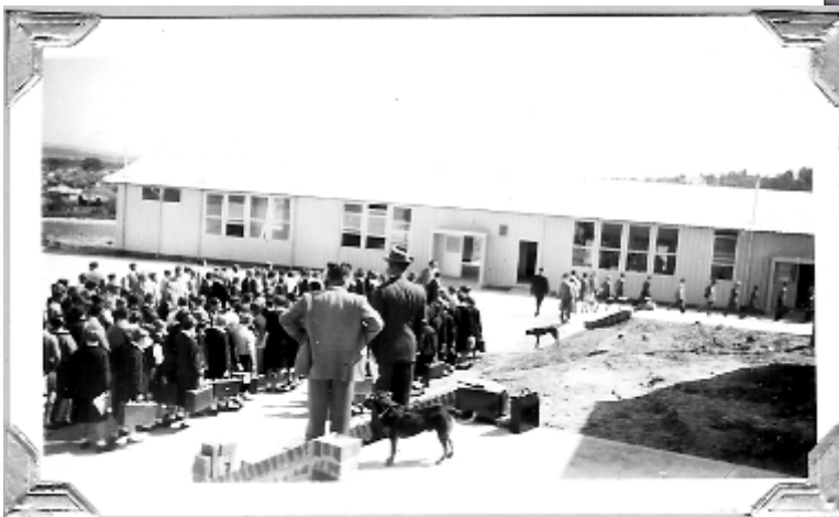
The original buildings in the late 1950s

Watch the website for news about the opening of the Stage III buildings in the next few months. It will be an opportunity to tour the new facilities and see how our school has changed over time.