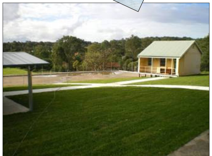
June 2009 – new basketball/netball courts; “Little House on the Prairie” lives on.