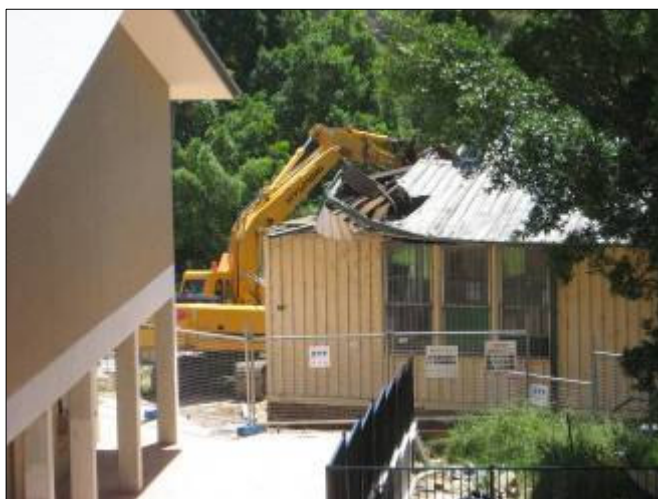
May 2009 – the end of the old block. The building (left) is stage III of the plan and now houses Industrial Arts