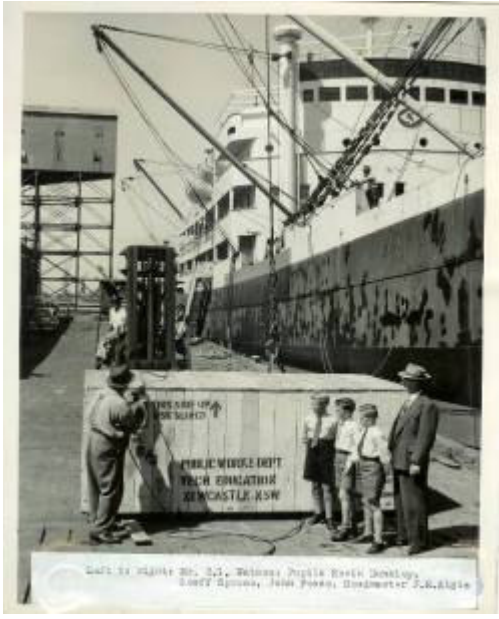
The buildings arrive on the wharves 1956

The last of the buildings erected in the 1950s was demolished in May. The Industrial Arts Faculty has now moved to brand new purpose built areas; basketball/netball courts are now being created where the old IA workshops used to stand.